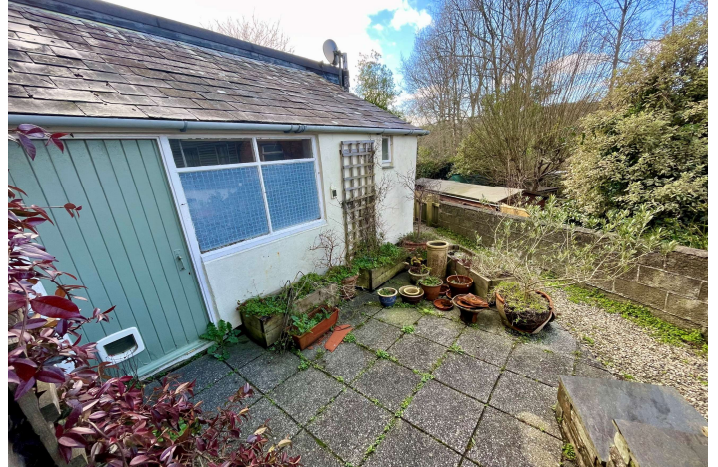
ATTACHED UTILITY ROOM/W.C